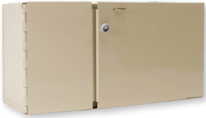
Mini IDC (Closed)