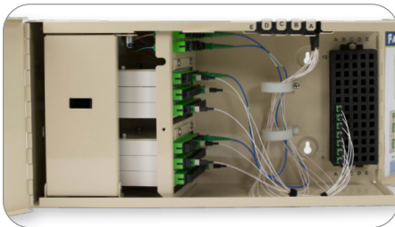
Mini IDC (Open)